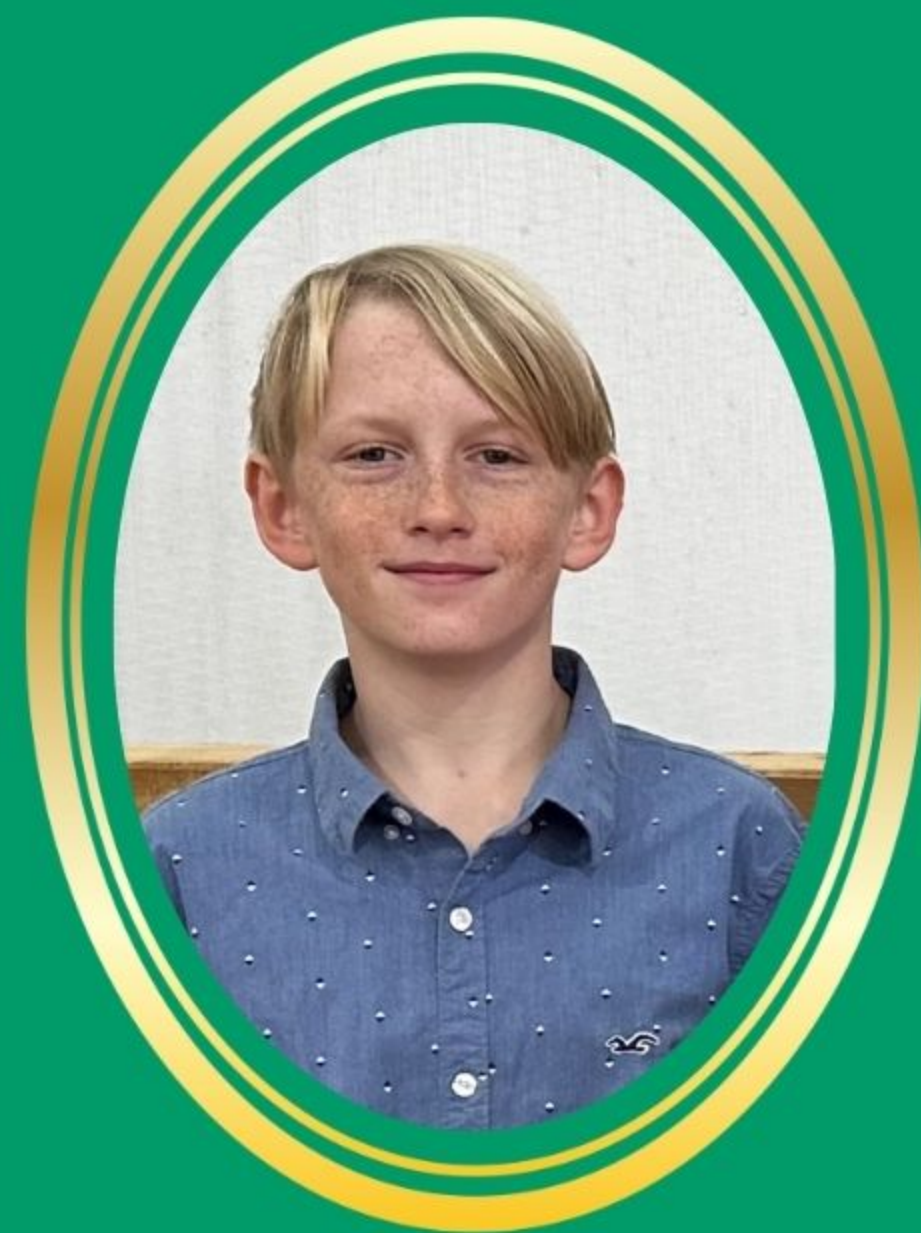
Grey ~Veterinary Science~