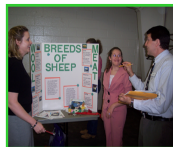
Exhibit should be able to stand alone and convey a complete message to audience